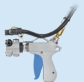
Ex-Ion blower guns