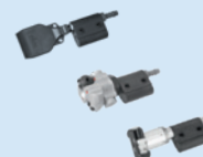
Ion blower nozzles