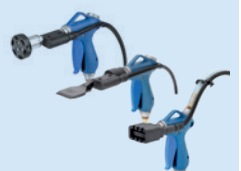
Ion blower pistols